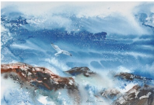
Ocean Mood V 14"x20"